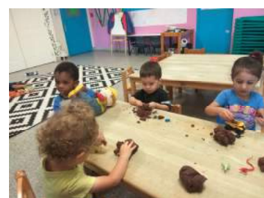
Early Years Room