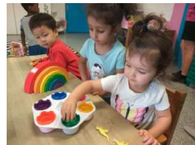
Early Learners / Junior Early Years Room